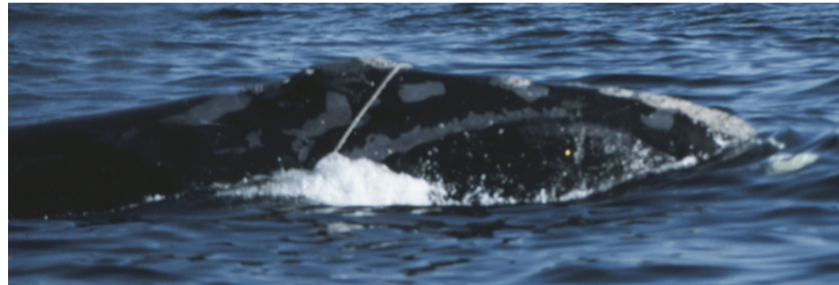
25 Oct 1986 NEA