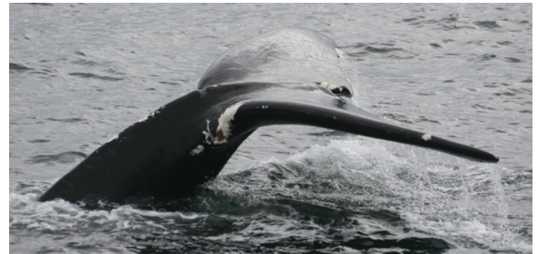
12 Nov 2008 WCNE