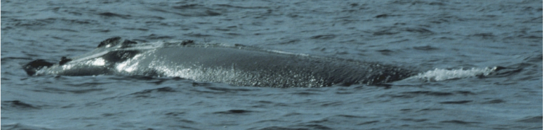
06 Sep 1984