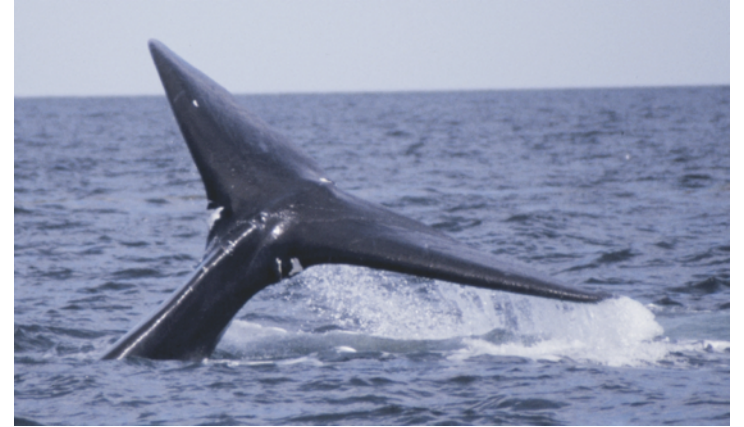
25 Aug 2003 ECE