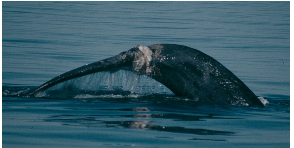
26 Aug 1997 NEA