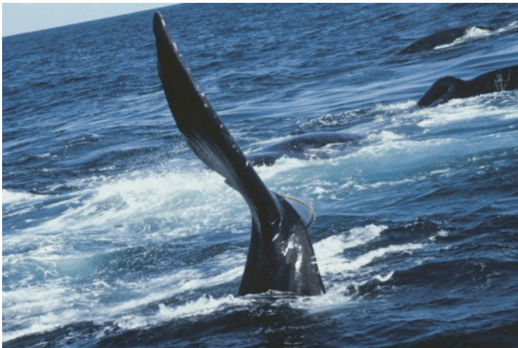
1987 Sep 25 NEA