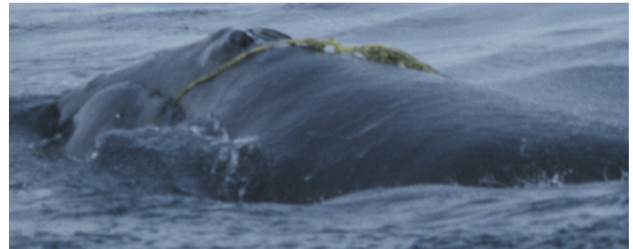
1989 Sep 13 NEA