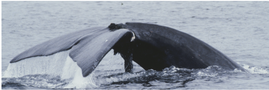
12 Sep 1987 NEA