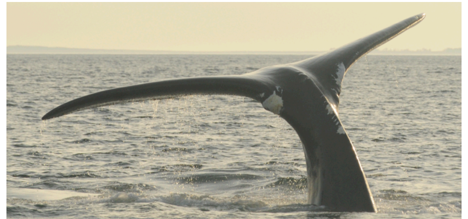
08 Sep 2008 WCNE