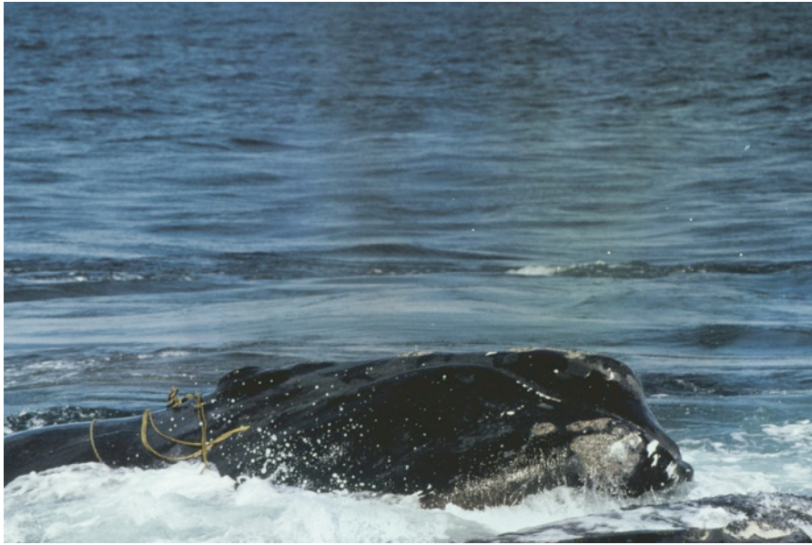
1987 Sep 25 NEA