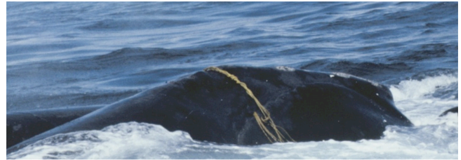
1987 Sep 25 NEA