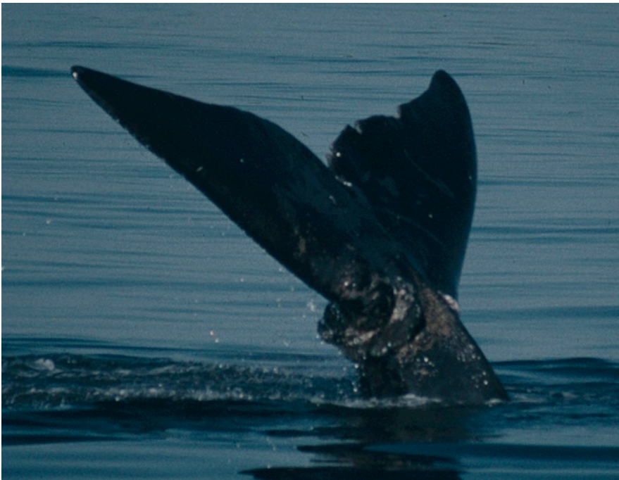
26 Aug 1997