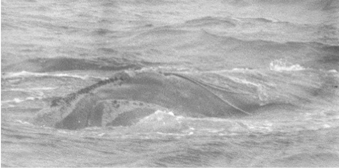
15 May 1983 PCCS