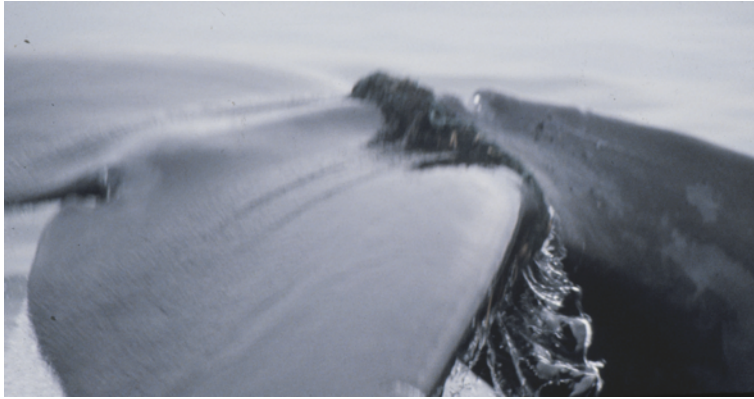
27 Aug 1981 NEA