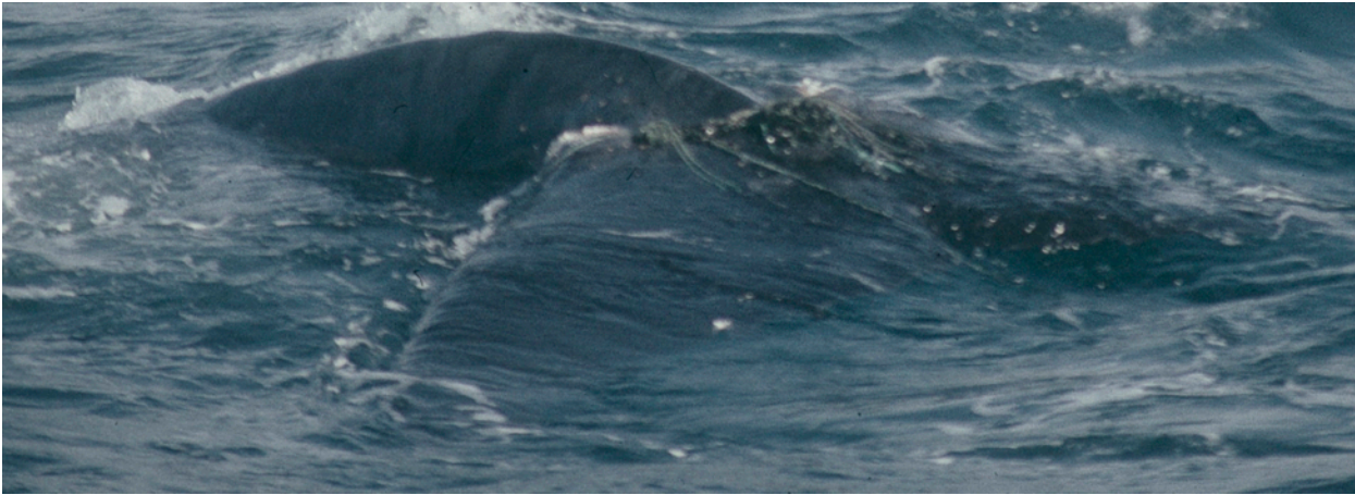
17 Sep 1988 NEA