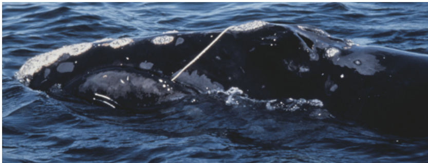
25 Oct 1986 NEA