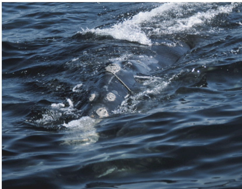
25 Oct 1986 NEA