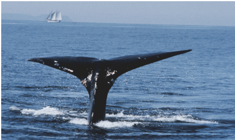
24 Aug 1990 NEA